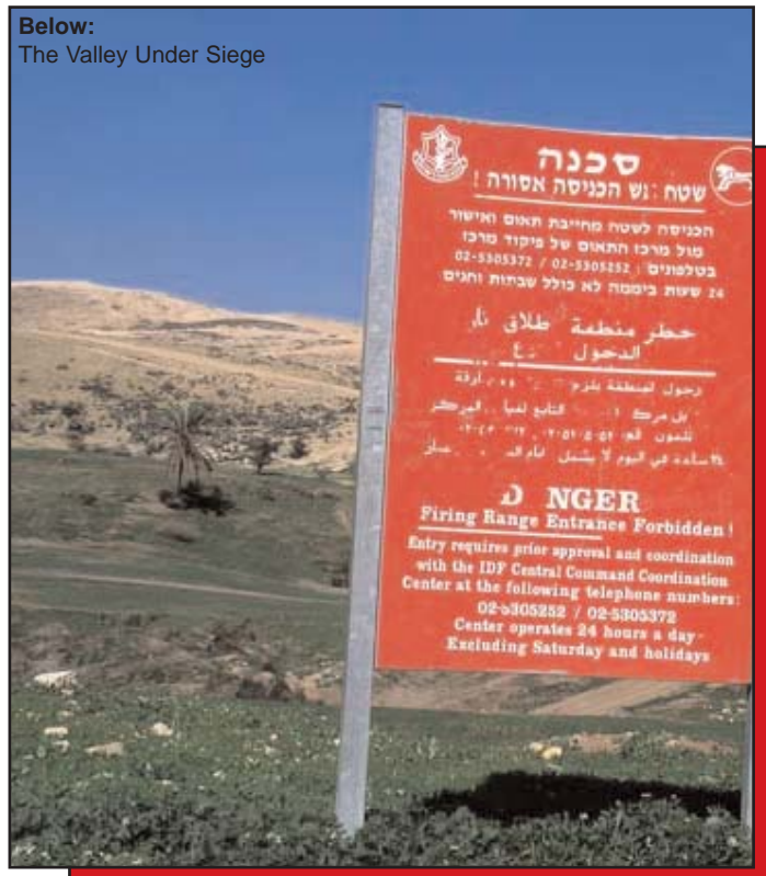
Below: The Valley Under Siege

The South , including Fassayel, Al Awja, Jericho, Diuk and Nu'ame, and Bedouin communities in al Khan el Ahmar and Nabi Musa. Other land-owners reside in Ramallah and Jerusalem districts. 80% of the territory in the Southern Jordan Valley has been "state" land under Ottoman, British and Jordanian rule. Today it is usurped by the Occupation.